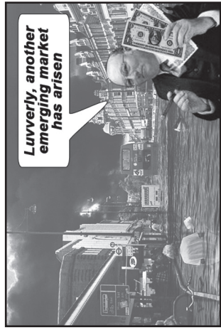
Luxuriously, another emerging market has arisen