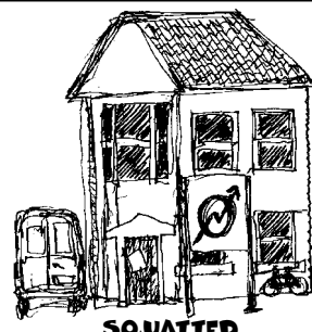
SQUATTED COMMUNITY CENTRE

capitalism while tut-tutting people who do something about it. The prominent individuals proposing this sort of ineffectual opposition soon find themselves getting newspaper columns, appearing on chat shows and generally being promoted by those in control of the media. Unless they show support for effective opposition on the streets, that is - in which case they can kiss goodbye to their newspaper columns.