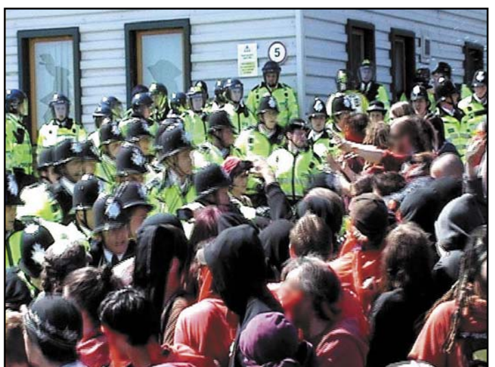
Protesters within the gates of EDO/ITT's Brighton premises

brutality we were able to show the massive disgust that exists at those who profit from death and misery. lent but anything that happened today pales in comparison to the damage inflicted by EDOs products in Iraq, Palestine, Afghanistan and Somalia. Congratulations to all who took part for their action and initiative and strength in refusing to be intimidated by the police aggression."