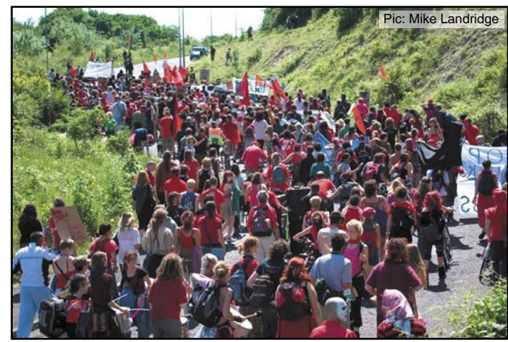
The carnival winds its way up Home Farm Road to the factory

After the Iraq War (not that it's mission accomplished) there has been a four year relentless campaign against EDO in Brighton. Despite an injunction under the Protection of Harassment Act (which failed) and over fifty arrests the campaign is still going strong. Their avowed aim is to expose EDO's complicity in war crimes and shut them down. There are regular Wednesday afternoon demos when workers leave the factory.