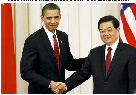
We can't tell Hu's the more relieved