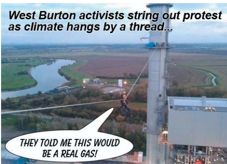
West Burton activists string out protest as climate hangs by a thread...

Many of the al-Jahalin Bedouin are refugees from the Naqab, forced to flee during the violent creation of Israel in 1947-48. Some families have been given brief respite with a Hight Court ruling in June that the re-location cannot take place until an environmental impact assessment due to its proximity to the Jerusalem Municipal Dump (sited illegally on land stolen from Palestinians). More than one thousand tons of rubbish are trucked to the