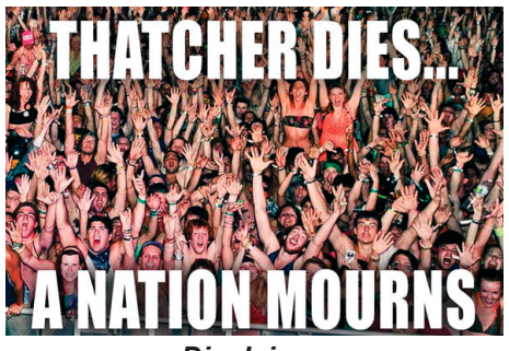
Disclaimer SchNEWS warns all readers, the newsletter's not for turning . Honest.

Subscribe! Get SchNEWS free every week by email in pdf or text file - visit our site, or send us stamps and we'll post it to you. Copy and distribute! Keep SchNEWS free with donations (via website or cheques payable to Justice?). Posted free to all prisoners. SchNEWS, c/o Community Base, 113 Queens Rd, Brighton, BN1 3XG. Tel +44 (0)1273 685913 Email mail@schnews.org.uk Web www.schnews.org.uk